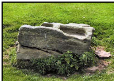
The Dipping Stone – Plague Stone or Saxon Cross?

Dave Brown leading a group of 15. On a dull but dry day we enjoyed a short but hilly walk over Whaley Moor where we discussed the provenance of the Dipping Stone. Continuing past the three Society signposts near the Moorside Hotel we climbed to Black Rocks for lunch before walking the edge and descending to Furness Vale. Having just missed a train and there being no hostelry open, some of the party returned to Stockport by bus whilst the rest enjoyed a sunny canal-side walk back to Whaley Bridge.