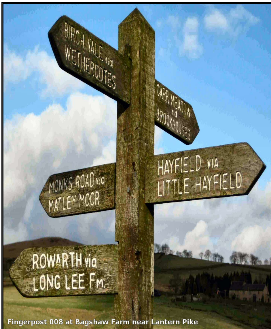
Fingerpost 008 at Bagshaw Farm near Lantern Pike

Newsletter of the Peak and Northern Footpaths Society