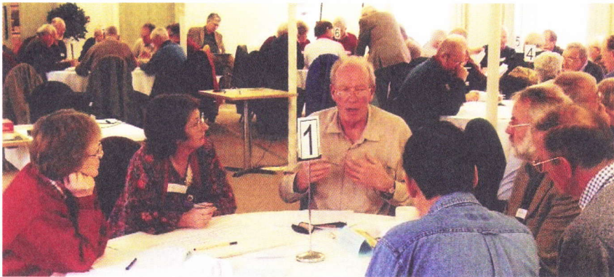
Inspectors hard at work at the 2004 Conference