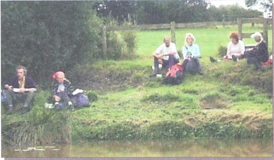
A waterside break on the Chelford Walk

11 miles, flat, easy going. Seven members out, including four inspectors. Showers, clearing by lunch time. Over farmland, through cattle (escorted by a kindly farmer) and past bushes loaded with soft fruit, to Marthall with its ambitious stream clearing. Lunch in the sunshine alongside a large pond provided for the benefit of fishermen. Back via Ollerton Hall, Colshaw Hall to Over Peover and return to Chelford.