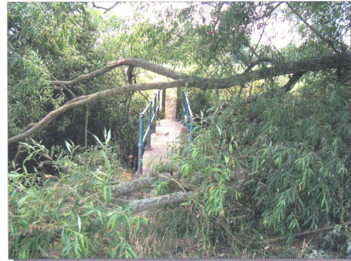
An Act of God blocks Culheth & Glazebury FP138