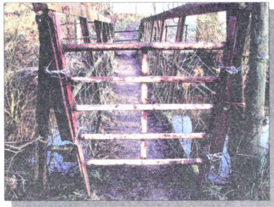
The bridge at Poynton before representation by the Society to Cheshire County Council...

..then successfully cleared for several weeks (right)