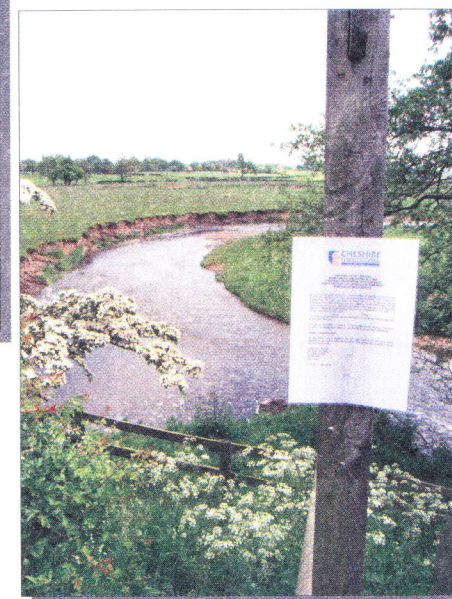
The problem at Prestbury 20