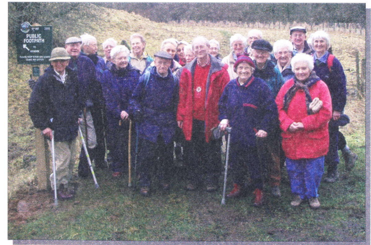
Members of the CHA Manchester Ramblers at the dedication of SP 307

Mills Hill to Newhey (Walk 17) 6.9 miles 980 feet ascent Man Victoria 10.33. Walk starts at Mills Hill Station 10.45 hrs. Note: this is a linear walk but return by train from Newhey to Mills Hill is possible.