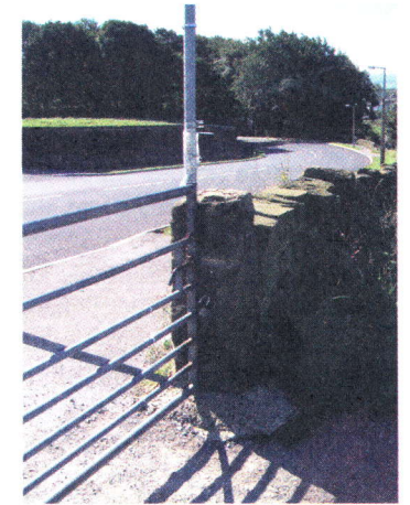
Padlocked gate and illegal notice. “Footpath closed”