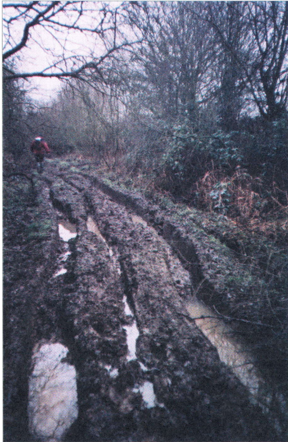
Sykehouse footpath 24 showing damage by 4x4s