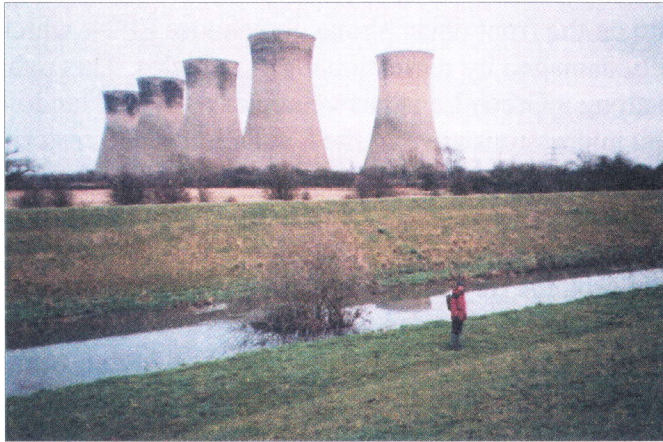
Photo 1: Thorpe-in-Balne FP2 looking south east at the site of the missing Saddle Croft Bridge. “I told you not to leave the dinghy at Fishlake” says John