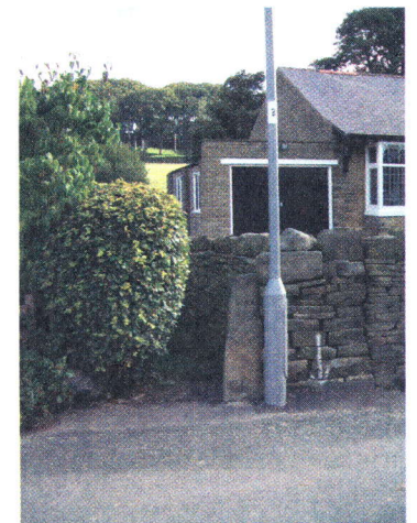
Overgrown hedge makes access difficult