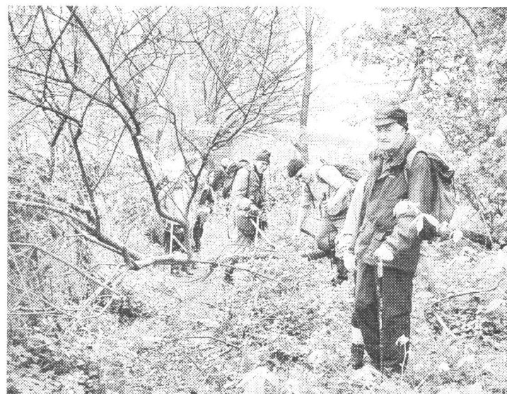
The party fighting its way through a path in Shevington

A path in Shevington, found to be subject to a temporary closure order, forced a change in the planned route for this walk, and, as the closed path included a footbridge over the M6 motorway, this was a quite substantial diversion, resulting in the walk exceeding the normal 10 mile limit by about half a mile. A gusty north-east wind greeted us as we got off the train at Blackrod, and rain looked likely as 32 walkers set off through the village and westwards into the fields beyond, skirting the north side