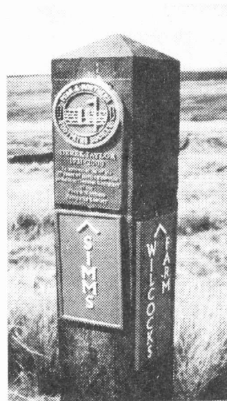
The signpost in place on Anglezarke Moor