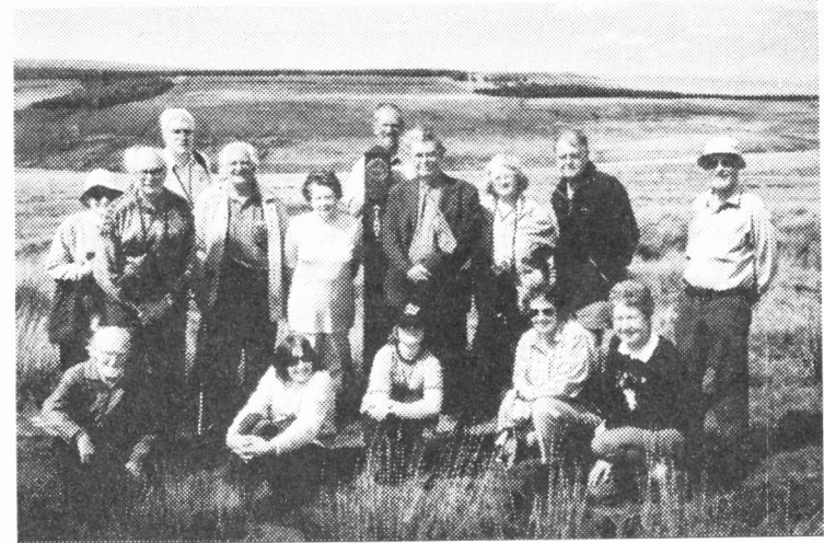
After the dedication: A happy group