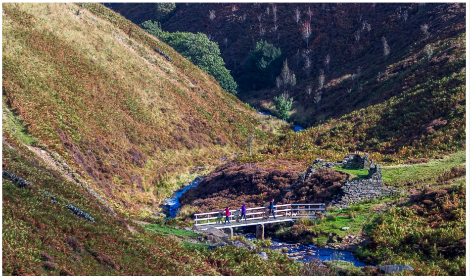
Blackpool Bridge funded by PNFS

Contact details - email: pnfs.meetings@gmail.com. Phone: 0161 480 3565