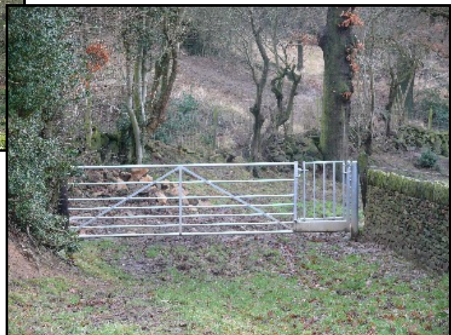
of gates on the newly created right of way near Ewden valley near Stocksbridge