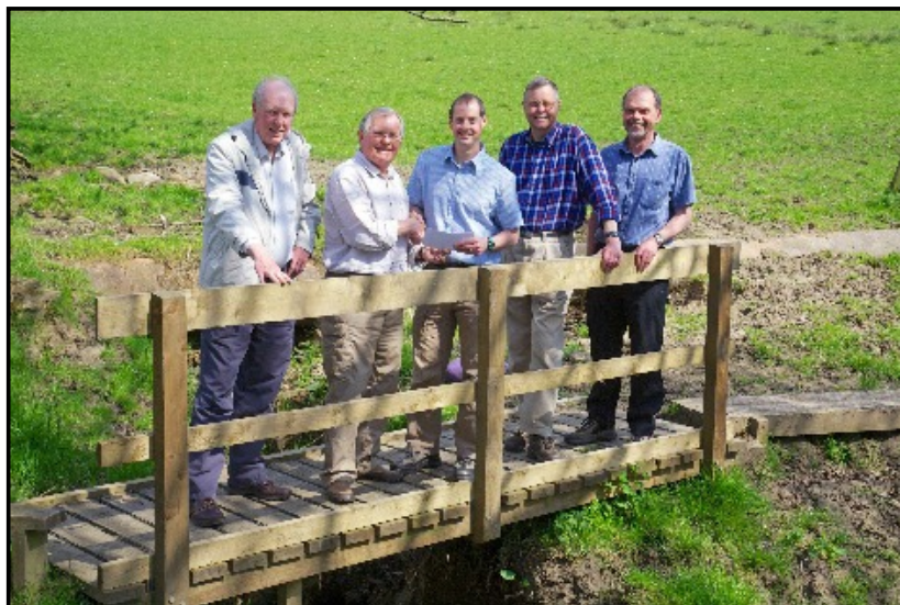
Bridge handover at Turton near Bolton

In contrast, little progress has been made during the year, on the two possible projects in Derbyshire at Chinley and Grindleford. Both require some funding contribution from the County Council which has not been forthcoming to date.