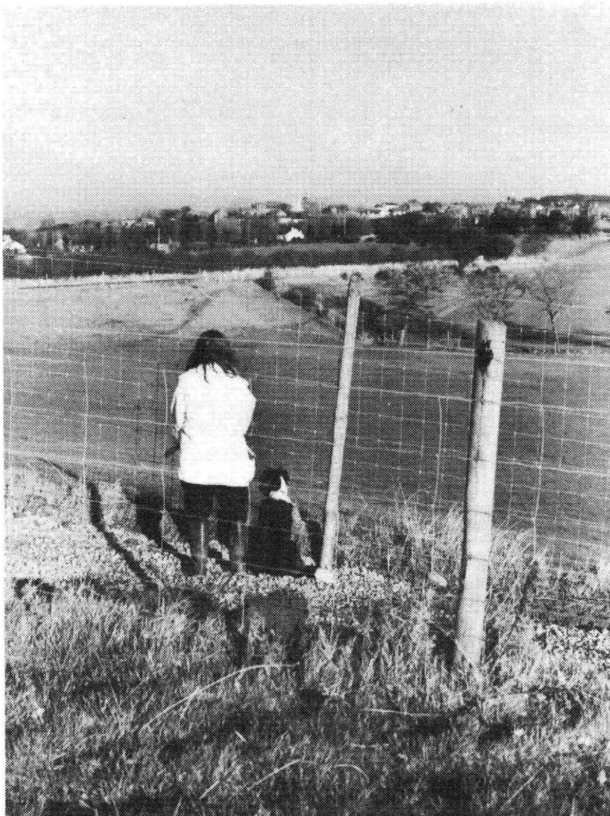
ABOVE: MARPLE 187 "THE DEER FENCE" NOVEMBER 1988